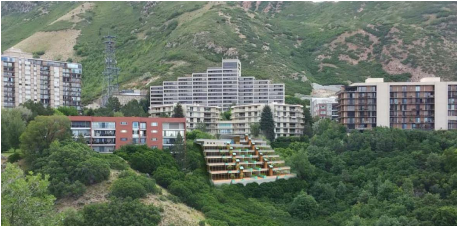
Rendering Provided by the Applicant